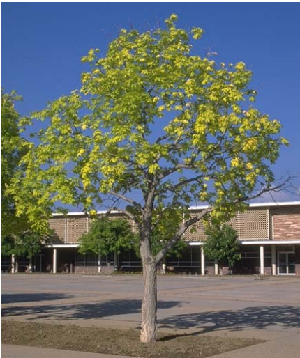
Figure 5: Yellow, chlorotic foliage from root disease.