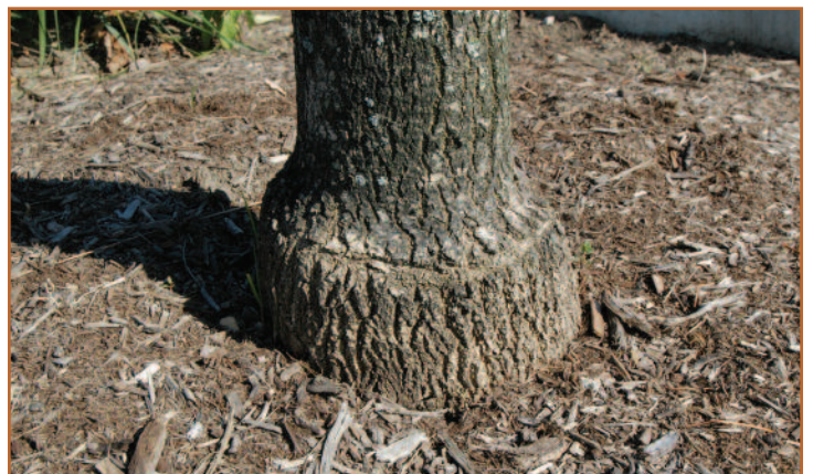
Figure 1. Some grafted trees may have a swelling at the base that could be mistaken for a root flare if planted too deeply.

Checking root depth can be done in the nursery before digging (preferred), or in the B&B or container root ball just prior to planting. Presence of a visible root flare is a good indicator that the structural roots are just below the soil surface. However, on grafted trees, be careful not to confuse the swelling of the trunk below the graft union with the actual root flare (Figure 1). A gap around the trunk at the soil line is a sure sign that the first roots are at least several inches below the soil surface (Figure 2).