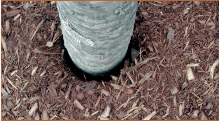
Figure 2. If a gap has opened up around the base of the trunk, the roots are too deep.

If none of these easily recognized signs are present in the field, or if the root ball burlap and twine cover the base of the tree, a surveyor's chaining pin or similar tool can be used to quickly and non-destructively probe for the roots. Probing approximately 3 to 4 inches away from the trunk will determine the true depth of the roots rather than the depth of the enlarged root flare, if present (Figure 3). At least two roots (preferably more) should be located within 1 to 3 inches of the soil surface.