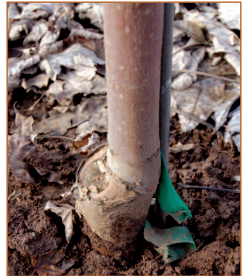
Figure 4. Bud-grafted cultivars, and some seedling trees, are cut back during production. Evidence of the pruning wound and "dog leg" in the stem may be visible for several years. A change in bark texture may always be visible.

If there is extra soil over the structural roots, it may be acceptable in some situations to leave the root ball intact, with the extra soil remaining above grade through the guarantee period. Some contractors prefer to leave the burlap, rope, and wire basket in place for a time to keep the root ball more stable and make it easier to straighten later, if needed. If the wrappings are not removed at