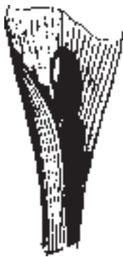
Figure 2: Aphid eggs deposited on a leaf (enlarged).