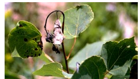
Figure 7: Shoot blight on aspen showing black and curled stem.

The leaf and shoot blight fungus survives the winter mainly on shoots infected the previous season. Spores are windblown early in the season and infect newly expanding leaves and shoots. As the season progresses, uninfected tissue becomes more resistant to the disease.