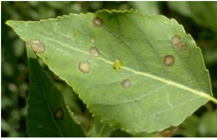
Figure 3: Septoria leaf spot showing tan circular spots.