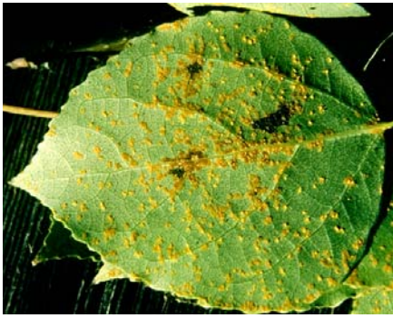
Figure 8: Leaf rust.