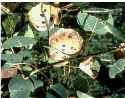
Figure 6: Ink spot disease on aspen in midsummer.

The appearance of Septoria leaf spots varies considerably between tree species and with time. Symptoms include a distinct tan circular spot with black margins and small black pimples in the center (Figure 3), and irregular brown to black spots that coalesce into large areas (Figure 4).