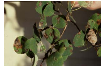
Figure 2: Marssonina leaf spot on aspen, late symptoms.