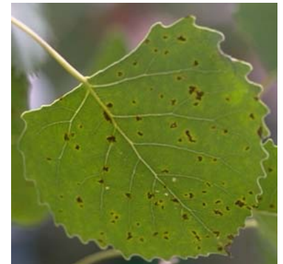
Figure 1: Marssonina leaf spot on cottonwood.

Marssonina survives the winter on fallen leaves that were infected the previous year (Figure 9). With spring and warmer, wet weather, the fungus produces microscopic "seeds" or spores that are carried by the wind and infect emerging leaves. Early infections are rarely serious, but if the weather remains favorable, spores from these infections can cause a widespread secondary infection. Heavy secondary infections become visible later in the growing season and cause premature leaf loss on infected trees.