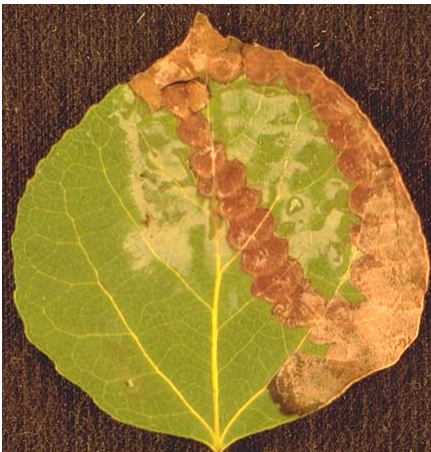
Figure 5: Ink spot disease on aspen in early summer.