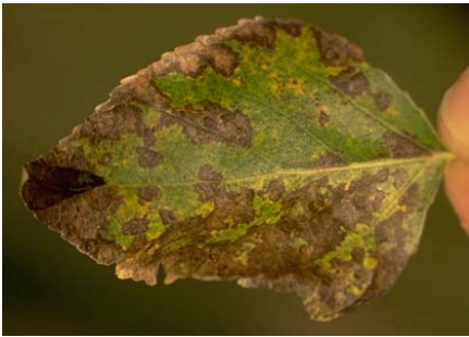
Figure 4: Septoria leaf spot showing irregular brown to black spots.