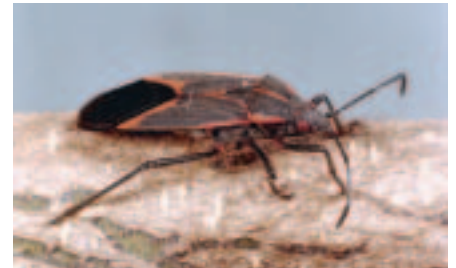
Figure 1: Boxelder bug.

For most people, the boxelder bug needs no introduction. This bug is about 1/2 inch long as an adult, black with three red lines on the thorax (the part just behind the head), a red line along each side, and a diagonal red line on each wing. The immature forms (Figure 6) are smaller and are easily distinguished from the adults (Figure 7) by their red abdomens and lack of wings. Boxelder bugs become a nuisance in and around homes from fall through early spring.