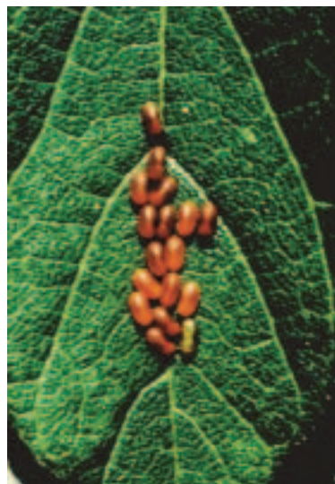
Figure 2: Boxelder bug eggs on leaf.

The boxelder bug overwinters as an adult in protected places such as houses and other buildings, in cracks or crevices in walls, doors, under windows and around foundations, particularly on south and west exposures. In the spring when tree buds open, females lay small, red eggs on leaves and stones and in cracks and crevices in the bark of female boxelder trees. The eggs later hatch into young nymphs that are wingless and bright red with some black markings. These young bugs usually are found on low vegetation near boxelder trees until seeds are formed on the tree, on which they start to feed.