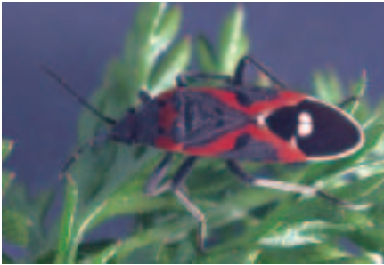
Figure 4: The small milkweed bug is a seed feeding bug that resembles the boxelder.