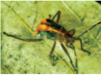
Figure 3: Boxelder bug nymph.