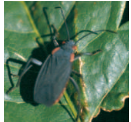
Figure 5: Goldenrain tree bug.

Use a vacuum cleaner to control bugs that have entered the house. Household insecticidal aerosols and many household spray cleaners also are effective when applied directly to individual insects. These measures provide temporary relief only. Bugs may continue to enter the home as they move about on warmer days throughout the fall, winter and early spring. Nuisance infestations should be finished by late May, as the boxelder bugs have either died or moved back to the host trees.