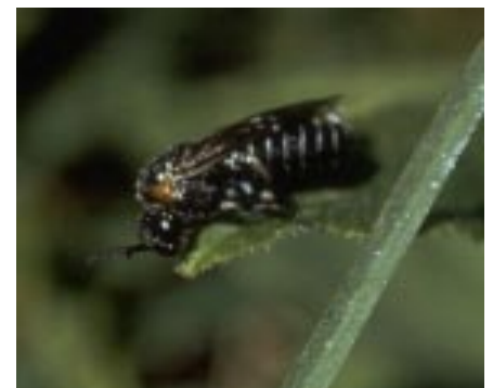
Figure 1: Brownheaded ash sawfly adult.

During most years, the larvae are active during May. They become full-grown by early June. Full-grown larvae shed a papery larval skin that remains attached to the leaf. They crawl to the soil, where they form protective cocoons. There is one generation per year. The larvae remain in the cocoons until the following season.