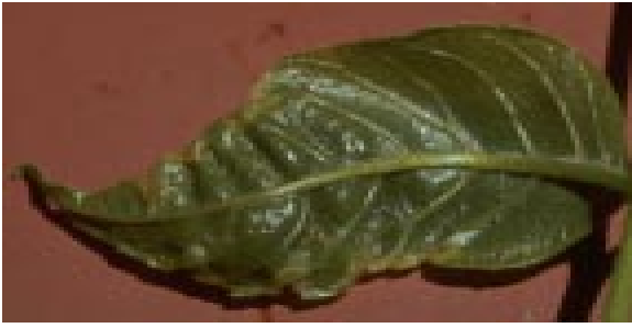
Figure 2: Distorted leaves from brownheaded ash sawfly egg laying.