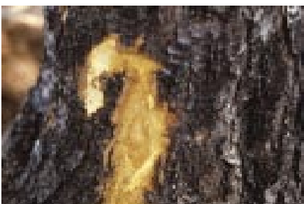
Figure 3: Collar rot symptoms — white, exposed bark and wood are healthy, while yellowish, exposed bark indicates early symptoms of collar rot.

white) just below the bark indicate initial collar rot and are the most indicative symptoms. Extensive death and discoloration of bark and wood can occur over several months. Tubercularia or Thyronectria cankers at the tree's base usually indicate collar rot is active or was active in the past.