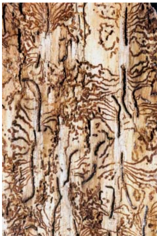
Tunneling by Ips hunteri in blue spruce.

Note: Concentrations of insecticides used to control bark beetles are often considerably greater than those used for insects on foliage. To avoid needle burning, try to limit the application to the bark, particularly when using liquid (emulsifiable concentrate) formulations that have increased risk of causing plant injuries.