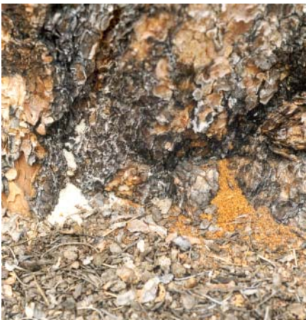
Boring dust at the base of a pine tree. Reddish boring dust is caused by ips beetles. The whitish dust is from ambrosia bark beetles.