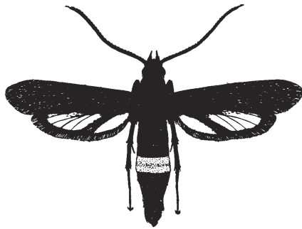
Figure 2: The heavier-bodied female peach tree borer moth has a broad band of orange or red.

In warmer areas, it may begin July 1 and continue into September. In general, peak egg laying occurs from mid-July to mid-August.