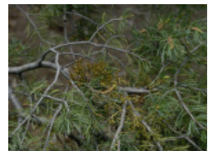
Figure 2: Dwarf mistletoe broom and plants.

These are small, leafless, parasitic flowering plants that grow on branches and spread only to other pinyon pines. They kill slowly by robbing the tree of its nutrients and water. Reproduction occurs when sticky seeds explosively discharge from the plant and adhere to the branches and needles of their next host. The life cycle from germination to dissemination is six years. This relatively slow rate of spread allows time for appropriate action.