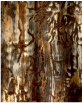
Figure 6: Ips galleries on pinyon.

and silk produced by the larvae. Larval feeding over the summer causes most of the damage. Generations take one to two years.