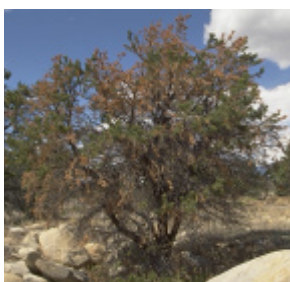
Figure 4: Erratic branch mortality of pinyon decline.