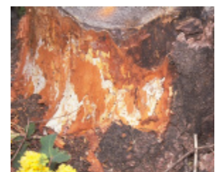
Figure 3: White fungal fans of Armillaria spp.

Armillaria spreads along roots and by rhizomorphs (fungal-root-like structures). One tree or a group can be attacked. The fungus can subsist on dead, woody material for more than 35 years. Armillaria prefers to infect trees that are already stressed by environmental factors or other pathogens. It prefers moist sites and moderate temperatures and is rarely found on extremely hot, cold or dry sites.