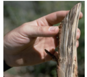
Figure 1: Vertical staining from black stain root disease.

This vascular disease causes extensive black staining of the sapwood in the root and lower stem before killing the sapwood. Bark beetles tend to follow as secondary pathogens and eventually cause the death of the tree. Spread occurs through root grafts and root contacts, and by insects that carry the spores (reproductive structures of the disease). Affected trees usually are in a group.