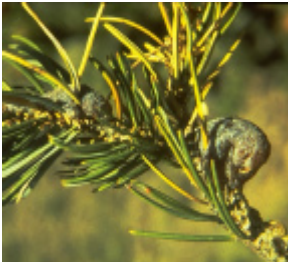
Figure 8: Pinyon pitch nodule moth.

mine the pith of the terminal growth, causing more damage as they grow. Large larvae move on to new tissue, cones or shoots. Pupation occurs inside the terminals and cones. Adults lay eggs from late June through August. There is one generation per year.