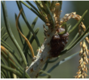
Figure 7: Pinyon tip moth.