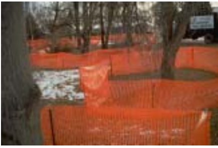
Figure 2: Highly visible tree protection barriers.

Once trees are selected for preservation, include specific preservation methods in the project plans and contracts. All parties should be aware of and agree to the consequences for noncompliance. To ensure compliance, contractors should have tree preservation bonds to cover noncompliance fines. Fines are based on species, tree value, and the amount and type of damage done. These bonds create an additional incentive for compliance.