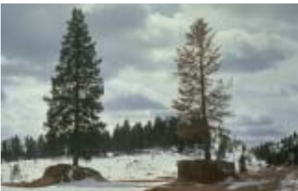
Figure 8: Lowering the grade severs roots and kills trees.

To protect the tree, terrace the grade (Figure 9) or build a retaining wall between the tree and the lower grade. Walls should encompass an area extending at least to the drip line.