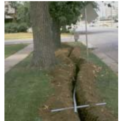
Figure 6: Trenching near trees can severely damage root systems.

Trenching for utilities can also cause substantial root damage and should be done far away from existing trees. In new developments, this can be done easily. Where the trench must pass under or near a tree, avoid substantial injury by using a power auger to bore a tunnel under the roots. If trenching is unavoidable, place the trench as far from the trunk as possible (minimum 8 feet), cutting as few roots as possible. Cleanly prune cut roots and refill trenches as soon as possible to prevent excessive moisture loss.