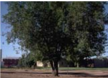
Figure 7: Within two years of adding 12 inches of soil, this tree died.

Wounds make the tree highly susceptible to root pathogens and decay fungi. Decline and death can result if more than 40 percent of the stem or roots are damaged or killed. Stressed trees are also more susceptible to insects such as bark beetles and borers.