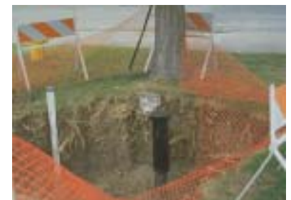
Figure 1: Roots lie in the upper 24 inches of soil and are easily damaged.

The root zone extends horizontally from the tree for a distance at least equal to the tree's height. Preserve at least 50 percent of the root system to maintain a healthy tree. During summer construction, trees require adequate water, enough to saturate the soil, every one to two weeks.