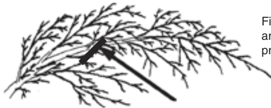
Figure 4. Pruning junipers and arborvitae back to a side shoot hides the pruning cut.

While shearing is quick and easy, it is not recommended, especially after mid-summer. Shearing creates a dense growth of foliage on the plant’s exterior. This in turn shades out the interior growth and the plant becomes a thin shell of foliage. Frequently sheared plants are more prone to show needle browning and dieback from winter cold and drying winds.