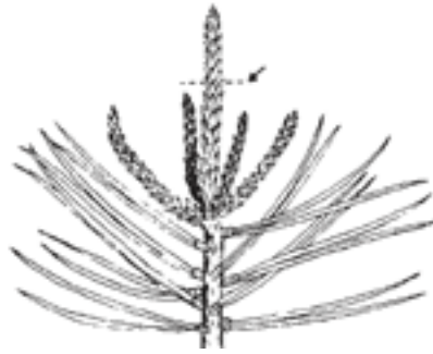
Figure 3. On pines, for bushier new growth pinch growing tips by snapping off 1/3 of the “candle” tips with fingers. Since pines produce few side buds, they are intolerant of more extensive pruning.

While shearing is quick and easy, it is not recommended, especially after mid-summer. Shearing creates a dense growth of foliage on the plant’s exterior. This in turn shades out the interior growth and the plant becomes a thin shell of foliage. Frequently sheared plants are more prone to show needle browning and dieback from winter cold and drying winds.