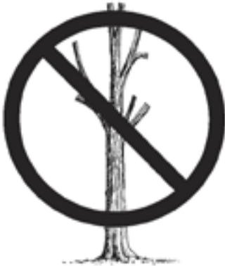
Figure 2. Never top a tree, the regrowth is unnaturally dense, elongated, and structurally unsound, making it very prone to wind and storm damage.

Shade trees should never be topped. The regrowth of a topped tree is structurally unsound. Topping required by utility right-of-way pruning is starkly obvious and sets an unfortunate community standard. Instead of topping, use crown cleaning or crown thinning.