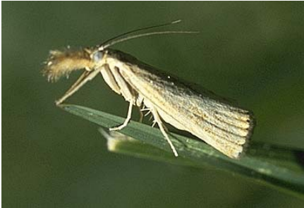
Figure 2: Sod webworm adult moth.