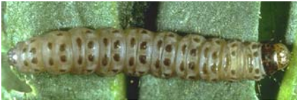
Figure 1: Sod webworm larva.