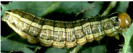
Figure 3: Bronzed cutworm larva.