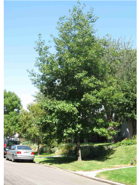
The VerDur difference. The photo on the left was taken Sept. 2009 before we injected it with VerDur. To the right, same tree one year later. It worked!